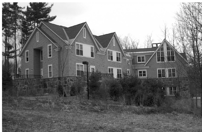
A view of the Middlebury Chapter House.

The officers of the Middlebury Chapter and the Society's Board of Governors hope to see you in October at the Middlebury Convention.