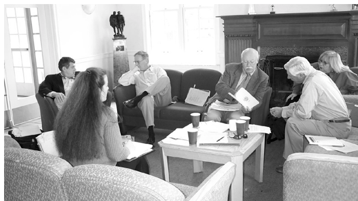
The Board of Governors discuss business during their Middlebury meeting.

The board accepted the return of the Bowdoin Chapter charter with deep and sincere regret. It reiterated that the Bowdoin Graduate Organization remains an active, voting member of the Society and stressed the Society's desire to assist the Bowdoin organization whenever possible with the hope that the Bowdoin