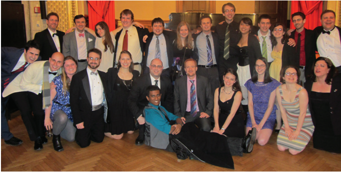
Some Conventioneers pose for a group picture after the Banquet

As part of that ongoing effort, we altered most of our traditional Convention business format to use an “Open Space” framework. We encouraged every attendee to lead or attend discussion sessions about topics they wanted to discuss. Everyone made choices to receive more value out of their time.