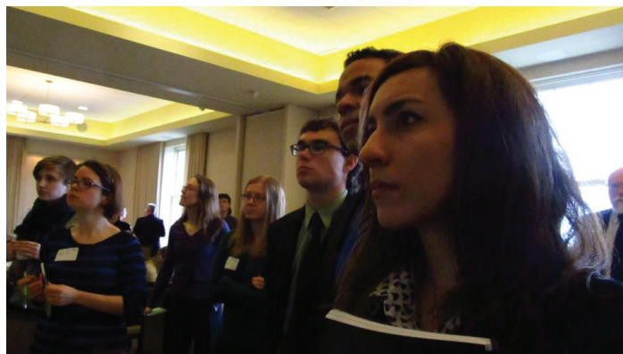
Conventioners prepare to choose discussion groups to join