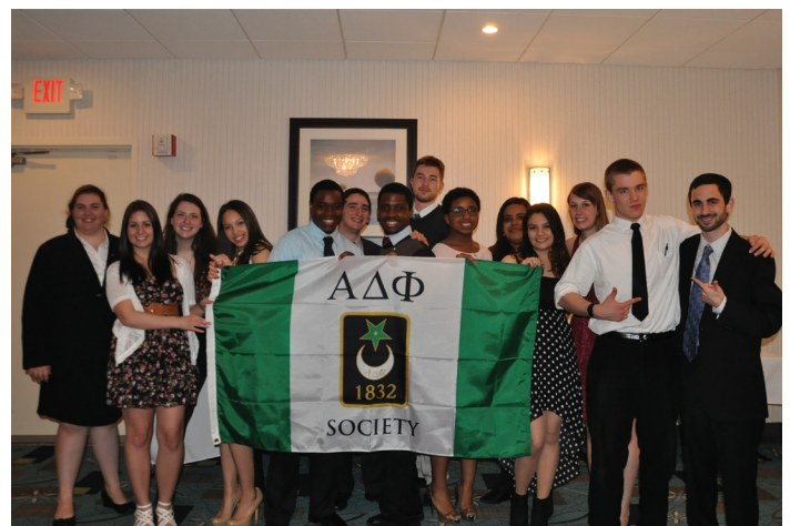
The Founding Members of the Plattsburgh Affiliate on their initiation night with their Binghamton Big Siblings