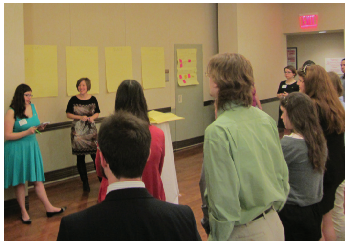
Reporting back from the Convention breakout discussion sessions

Seated on the floor; Croissants hover overhead. Talking sibling time.