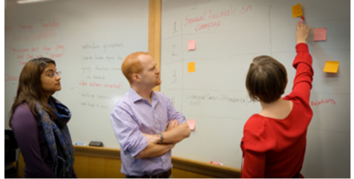
Explaining the open-space Convention session concept.