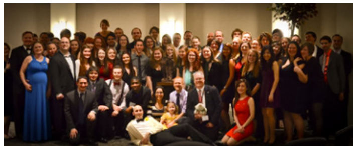
The 14th Society Convention and Leadership Training Conference Group Photo.