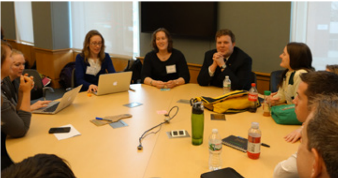
Participating in an open-space Convention session.

The Open Source experience was particularly beneficial to me as a delegate of a young chapter. Alpha Delts offered their wisdom on topics such as recruitment of males, communication between undergraduates and alumni, and how to properly help members dealing with mental health issues. When there is a lack of precedent, advice from more established chapters is crucial.