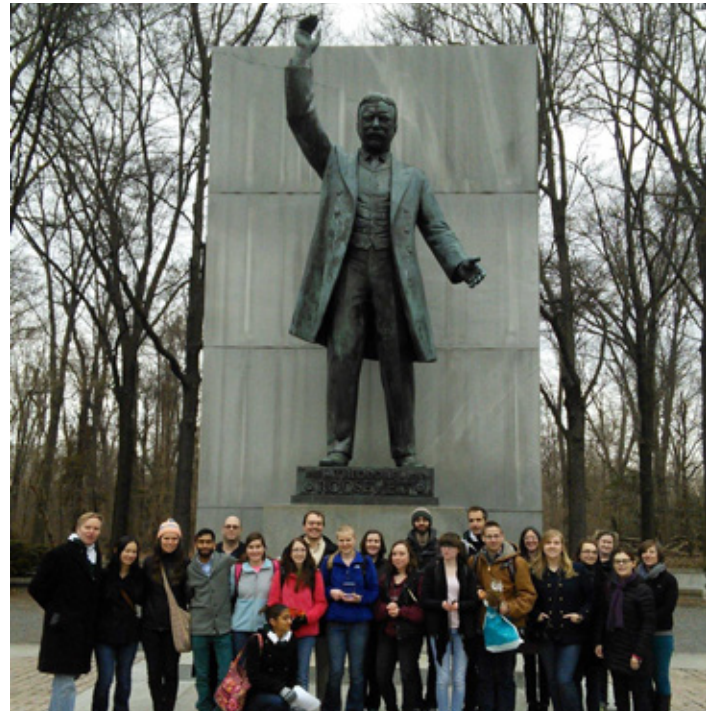
Capital Affiliate of the Adelphi Society's siblings with Theodore Roosevelt.

The new members of the Capital Affiliate would like to thank everyone who has helped us thus far, and we are excited to grow as a group with your support! Shout out to our Pledge Masters, Bigs, and other dedicated Alumni in DC: we would not be here today without you!