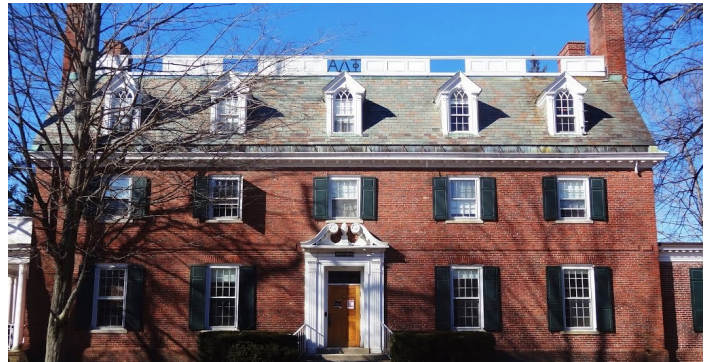
The Bowdoin Chapter House, now known as Howell House

Delegates, Society Officers, and other Convention goers will gather for business sessions at a beautiful conference center at a new hotel two short blocks from the House during the day. At the same time, the 175th Anniversary Reunion will be holding events throughout the weekend celebrating 175 years of the Alpha Delta Phi at Bowdoin. These events will include museums tours, viewings of ADPhi memorabilia and historic documents in the College Archives, and talks about