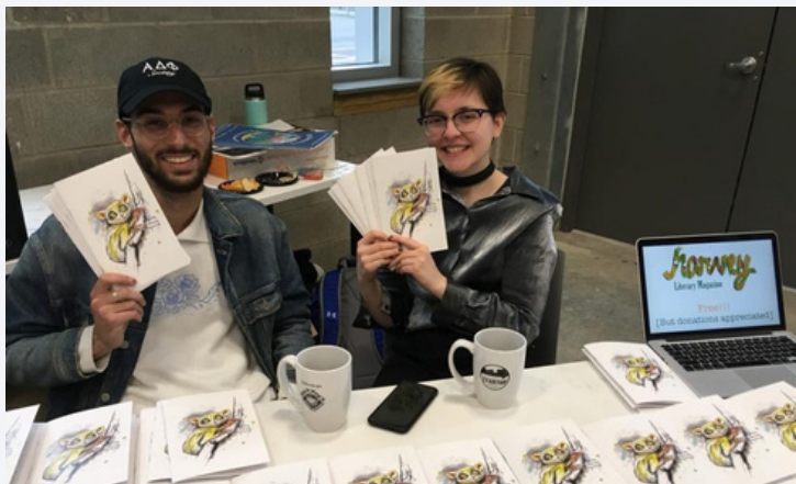
The Binghamton Chapter at their annual Art Awakening event, Binghamton University (2018)

As a living, breathing organization, rooted in a tradition of shared values, we proudly redefine what it means to be a Greek-letter organization.