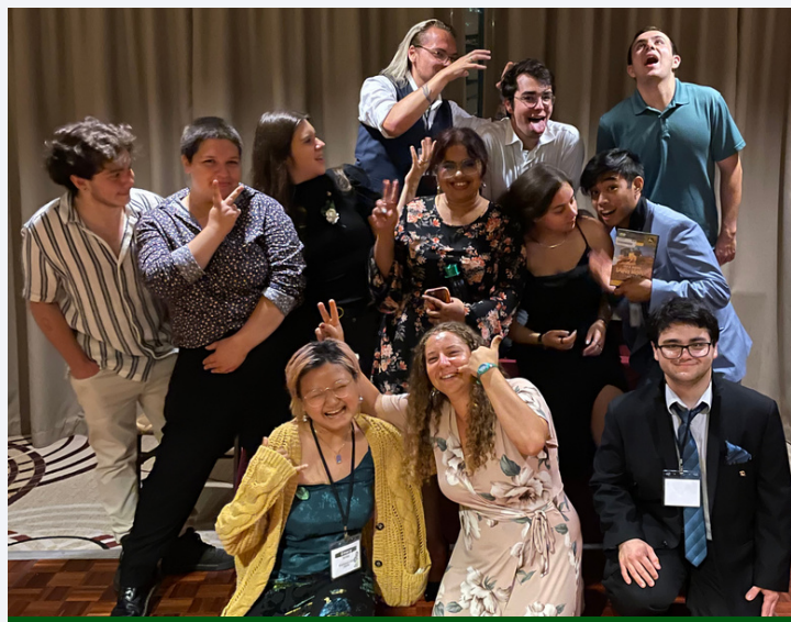
Undergraduates at the annual Convention and Leadership Training Conference (2022)

The first semester will be guided by assigned alumni advisors who will act as new member educators and mentors throughout the process of founding a new affiliate chapter. After founding, new members will continue to work with the alumni to grow as an affiliate chapter, establish a presence on campus, set sustainable budgets, and get involved at the national level.