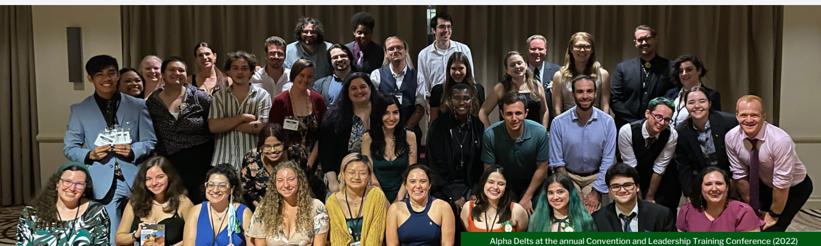
Alpha Deltas at the annual Convention and Leadership Training Conference (2022)