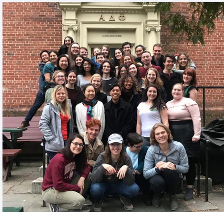
The Brunonian Chapter, Brown University (2019)