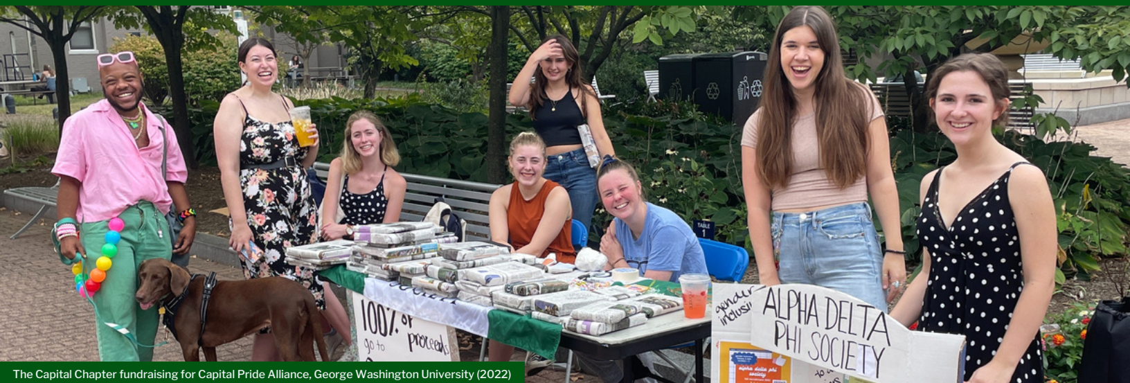
The Capital Chapter fundraising for Capital Pride Alliance, George Washington University (2022)