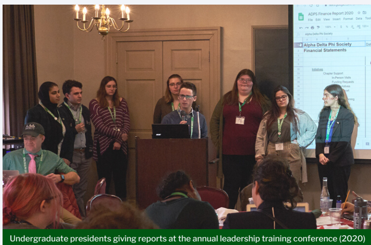
Undergraduate presidents giving reports at the annual leadership training conference (2020)

As a living, breathing organization, rooted in a tradition of shared values, we proudly redefine what it means to be a Greek-letter organization.