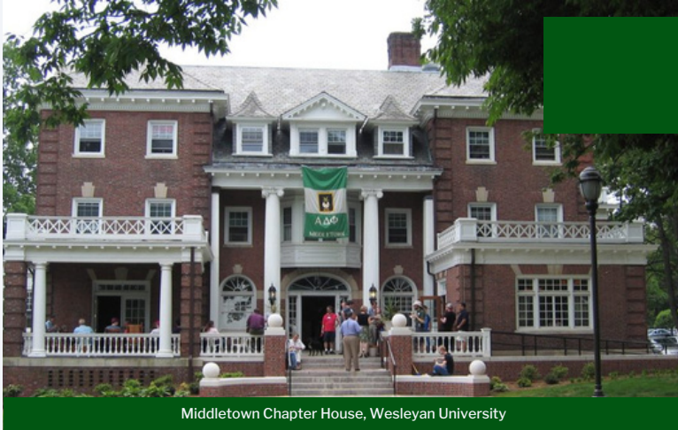
Middletown Chapter House, Wesleyan University