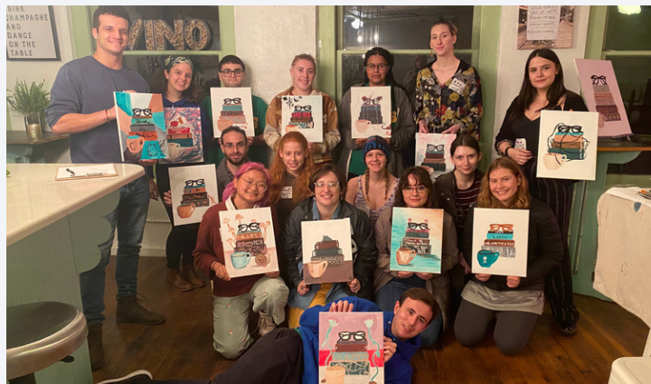
Undergraduates from various chapters at Undergraduate Caucus (Fall 2022)

A diverse, gender-inclusive group of around 10-15 interested students meeting these criteria will be guided through the founding process by a group of dedicated alumni.