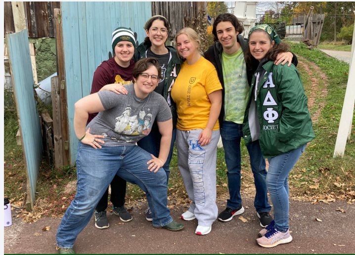
Ursinian Affiliate undergraduates volunteering at Pawsibilities, Ursinus College (2022)

Any event with alcohol must be registered with the supervising university and local policies must be followed. There are also student-led walk-throughs to ensure that regulations are enforced.