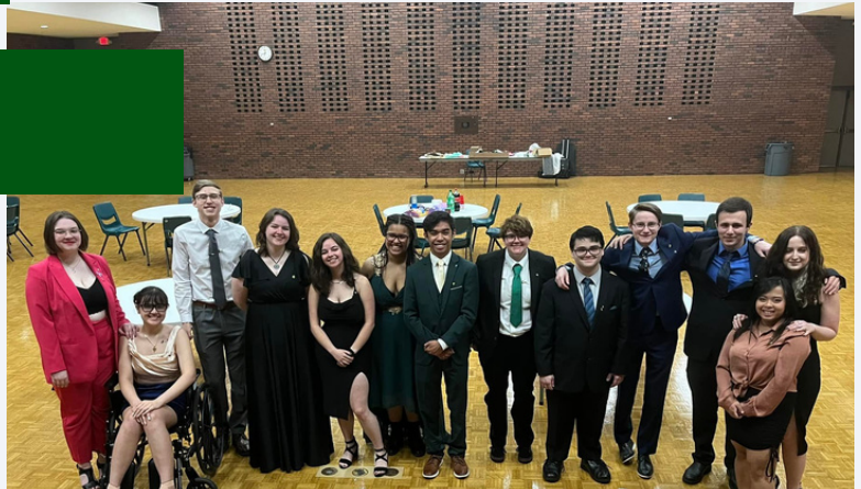
Flint Affiliate Founding Class, Kettering University (2022)

Our mission is to bring together a diverse and supportive community, foster intellectual and personal growth, and cultivate passionate individuals of good character and integrity.